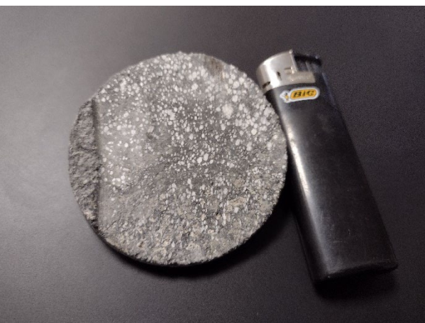
Jadarite nodules in shale, drill core, Jadar Basin, Serbia