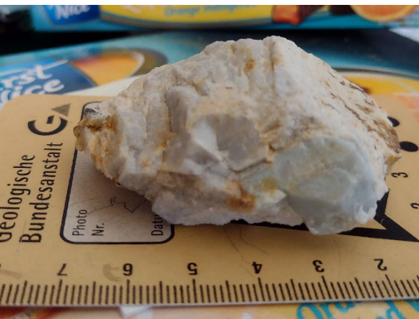
Beryl in pegmatite, Cer Mt., Serbia