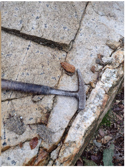
Pegmatite vein in enclave-bearing tourmaline granite, Cer Mts., Serbia