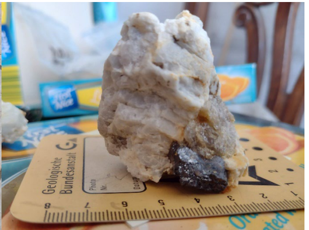
Columbite in pegmatite, Cer Mt., Serbia