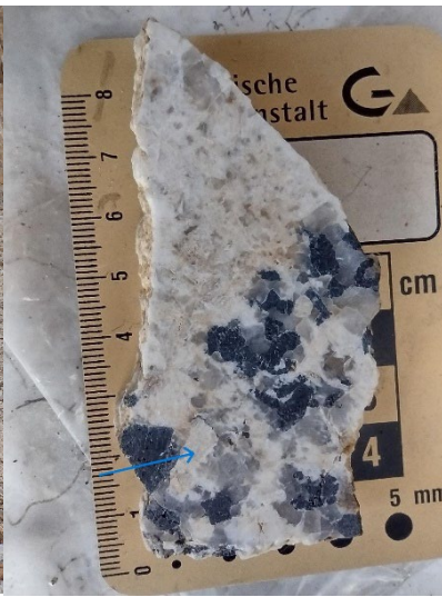
Albite pegmatite with tourmaline and apatite clots, beryl (arrow) and microscopic columbite, Terego