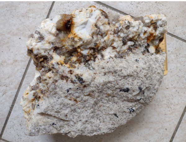
Beryl- and columbite-bearing pegmatite in tourmaline granite, Cer Mt., Serbia