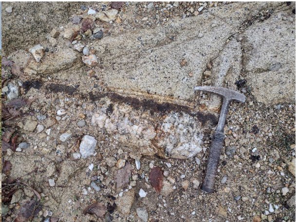
Beryl- and columbite-bearing pegmatite vein in tourmaline granite, Cer Mt., Serbia