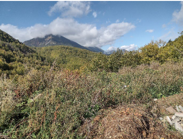
Šar Mountains along the Kosovo – North Macedonia border