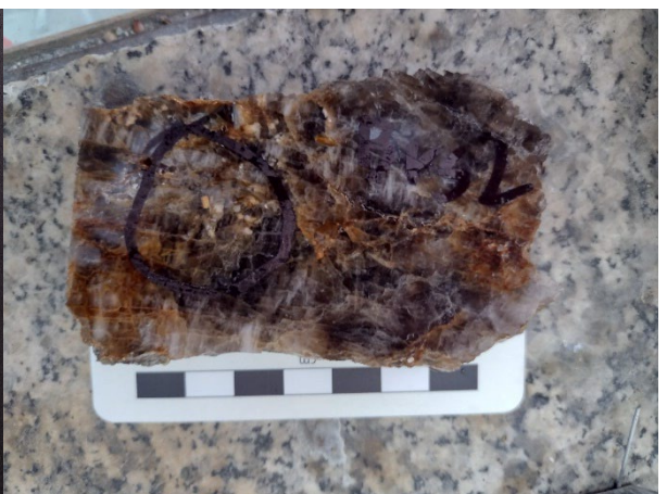
Beryl in pegmatitic smokey quartz, Brusnik, Bosnia Serbia