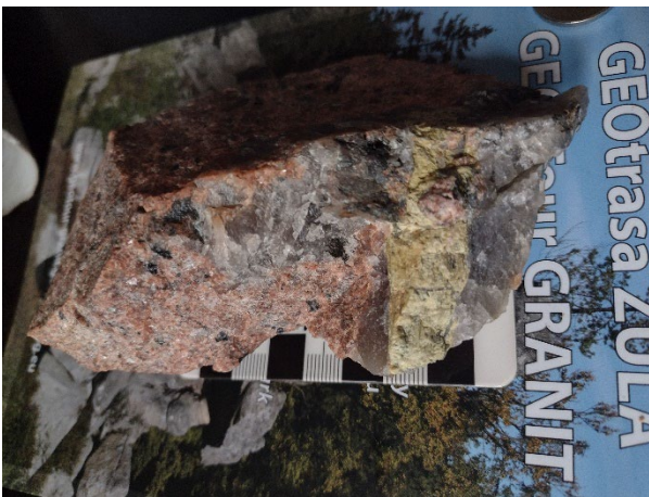
Beryl in microcline gneiss, Grădiştea de Munte