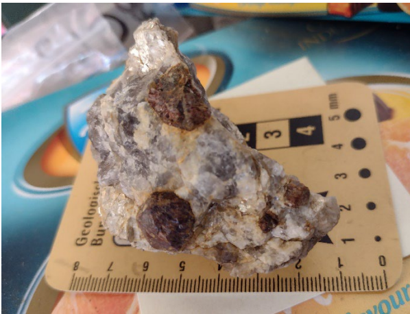
Garnet pegmatite, Crişma-Voislova, M. Mic