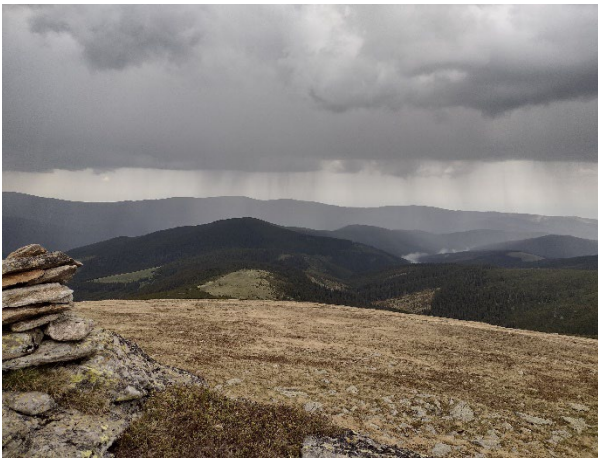
Bad weather, bad timing, Lotru Mts.