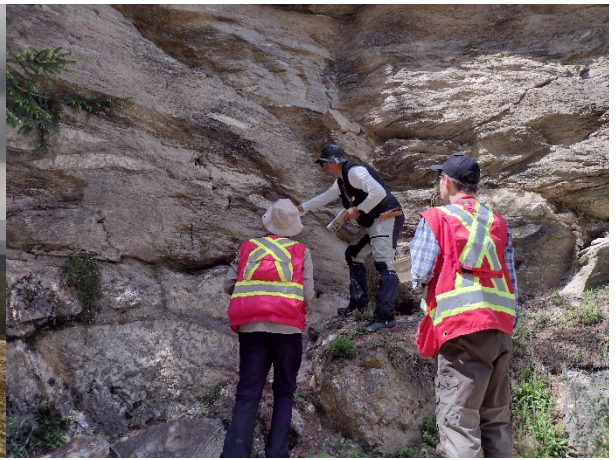
Structural measurements in the Cataracte Dome together with the BRGM colleagues