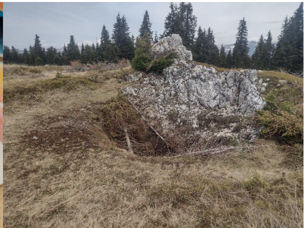
Old trench in the quartz core and the blocky zone of a beryl pegmatite, Mănăileasa Mts.