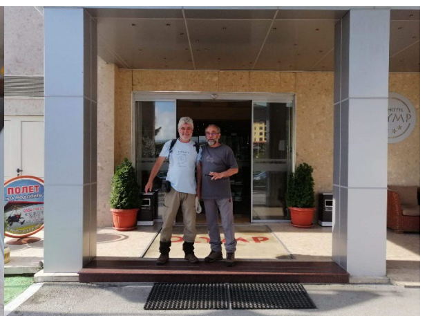
Looking forward to leaving for the fieldtrip, Velingrad eastern Rhodopes