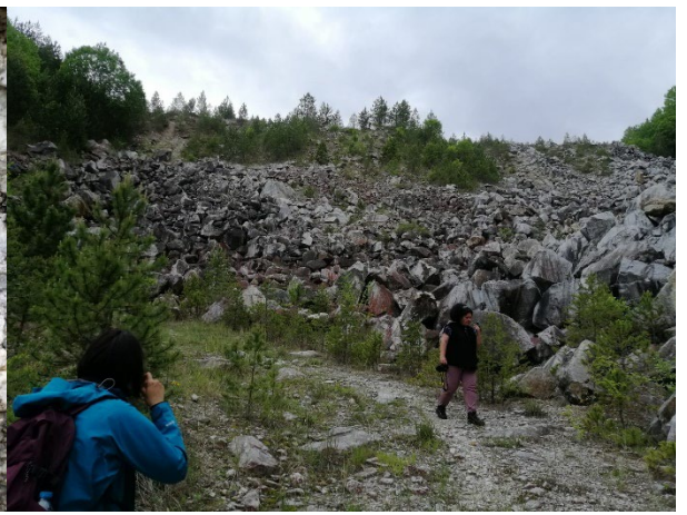
Pegmatite intruded in marble in abandoned quarry, Lepenitsa, Rila Massif