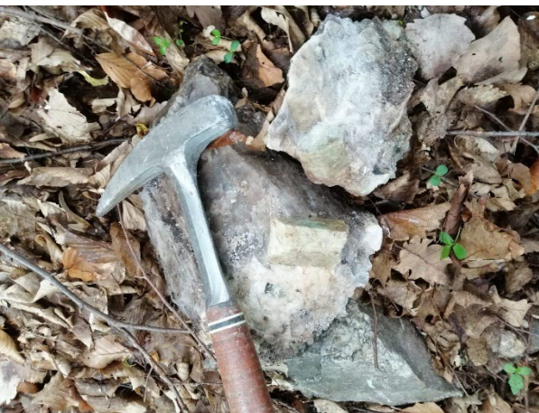
Beryl in rare metal pegmatites at Strelcha, Srednegorie Massif