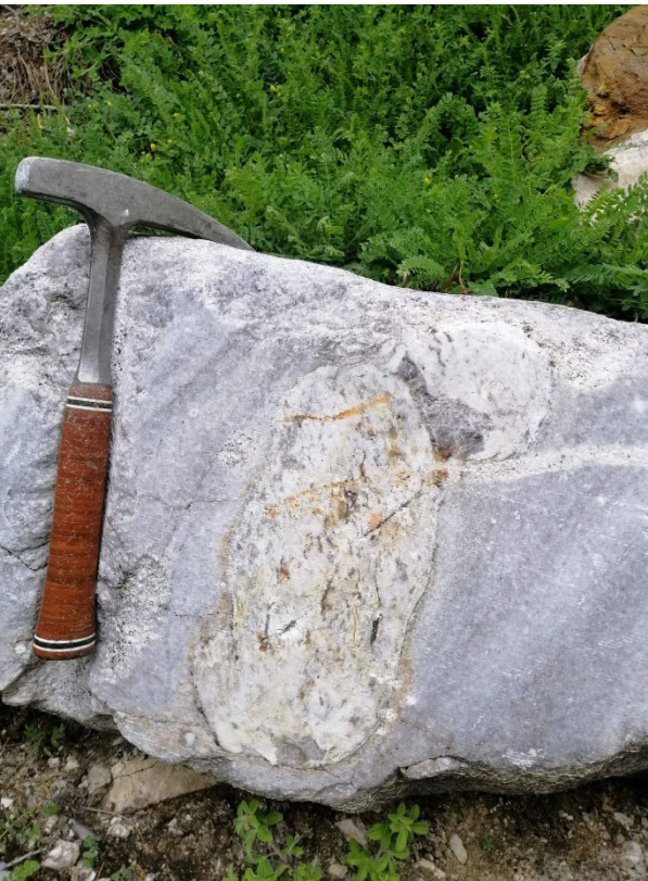
Pegmatite intruded in marble, Lepenitsa, Rila Massif