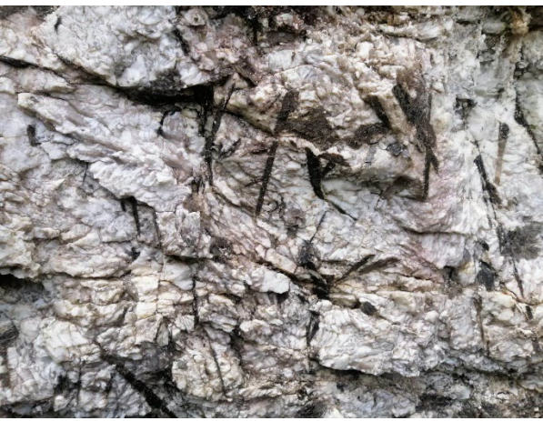
Biotite-bearing feldspar pegmatite, Rakitovo, Rila Massif