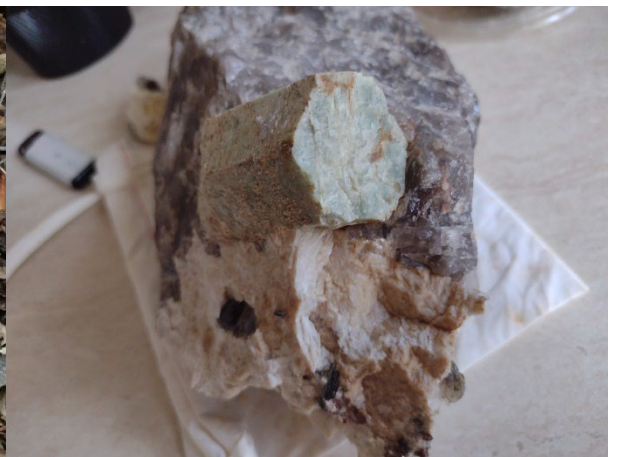
Beryl crystal from the blocky zone of the Strelcha pegmatite