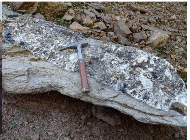
Pegmatite vein in sheared host-rock, Valea Ierii, Gilău Mts.