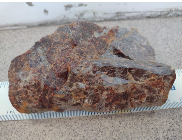
Pyroxmangite pegmatoid, Răzoare, Preluca