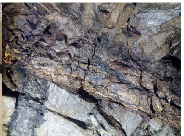
Ti-Nb and REE ore vein, Jolotca