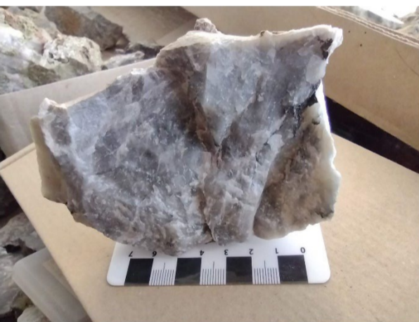
Pegmatitic nepheline, Güdüc, Ditrău alkaline massif