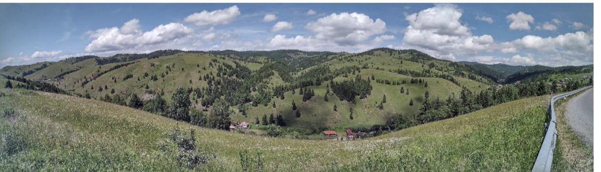
Panoramic view of the Jolotca orefield