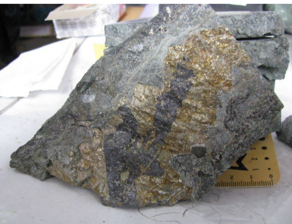
Ti-Nb ore with pyrite, Jolotca