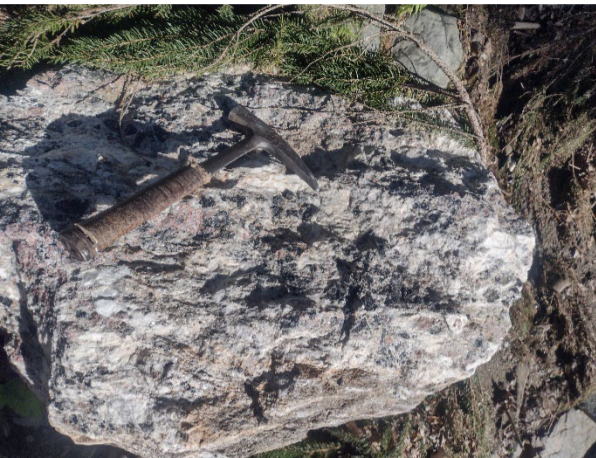
Sheared garnet and tourmaline pegmatite, Scărișoara brook, Rodna Mts.