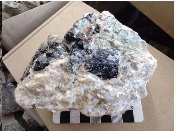
Tourmaline and apatite in pegmatite, former Ciungi mine, Preluca