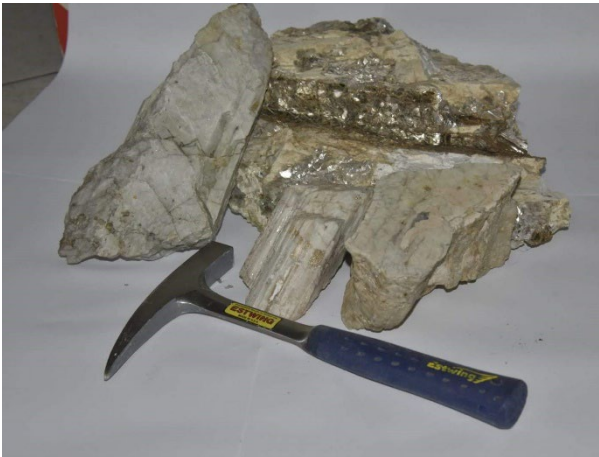
Mineral commodities from the Lotru pegmatitic field: spodumene, beryl, feldspar