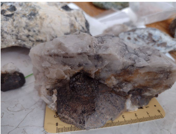
Garnet megacryst in quartz, Vidruța