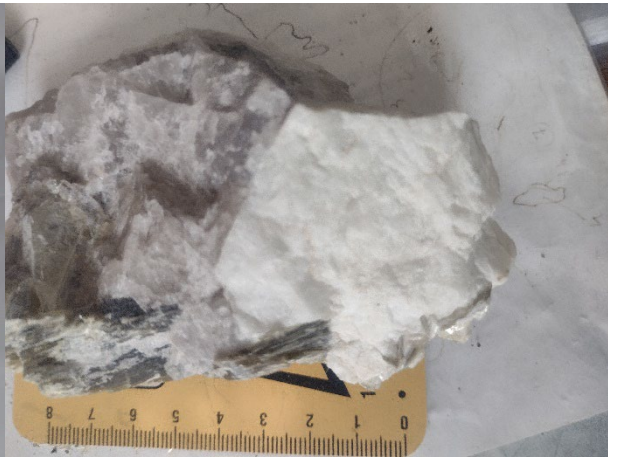
Beryl from the Conțu pegmatite