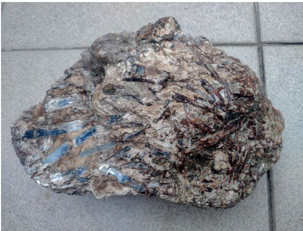
Kyanite and staurolite in oligoclase pegmatoid, Cristești, Lotru Mts.