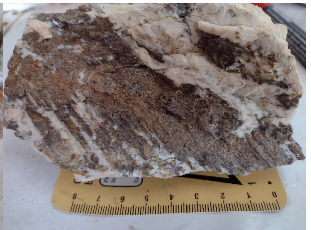
Skeletal garnet intergrown with albite, Vidruța